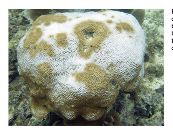
Figure 3. A partly bleached coral. The coral is still alive, but the polyps in the bleached parts have lost their symbiotic algae.