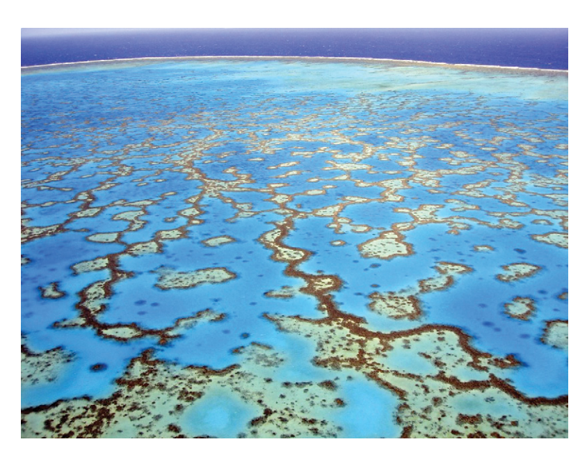
Figure 1. Aerial view of the coral reefs of Heron Island, Great Barrier Reef, Australia.

Most coral reef biodiversity lies not with the corals themselves (~1000 species) but rather with the many other organisms that live on reefs. Their numbers are highly uncertain, with estimates ranging from about one million to about 9 million species, and we know little about the extent to which