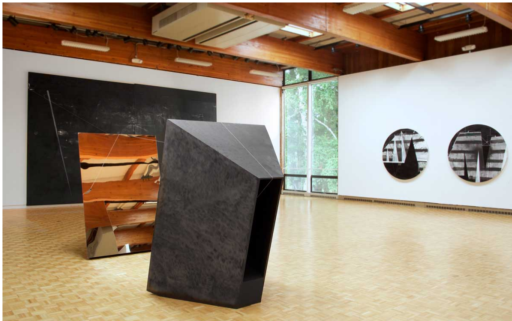
View of "Scalar," Usdan Gallery, 2018

presence. Dyson has suspended a hollow steel hyperrectangle (a rectangle expanded to a third dimension), which she found in the college's metal shop, by running the string through its cavity. As though arriving soon or recently departed, the steel construction hangs several inches from one of the mirror's "landing" spots. Recalling the squares-turned-elongated-rectangles of Orientation #1 and Orientation #2 —and, thus, Henry "Box" Brown's unfathomable journey—the metal is suspended between the two mirrors, whose reflective surfaces send both "box" and string careening in multiple directions at once. Indeed, both Orientation #1 and Orientation #2 featured a white string stretched vertically down the canvas's center; moreover, from certain angles, the string in 1994 seems to launch and weave itself into the trajectory of a third string that Dyson stretched diagonally across the exhibition's massive, nearly all-black diptych, suggestively titled I Can Feel You Now (Accumulation/Distribution) (2018).