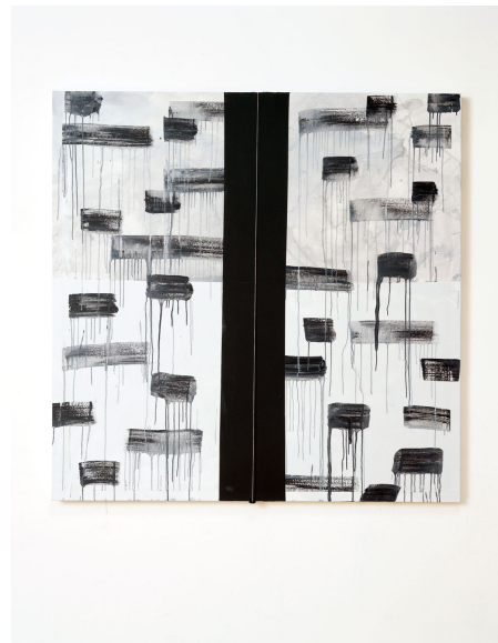
Orientation #1 and Orientation #2