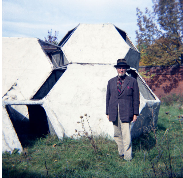
Left: Bennington Structure, Bennington College / Right: Tony Smith, 1961