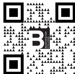
BENNINGTON AND SHAFTSBURY LOOP 20 miles

Enjoy one of these colorful Sunday drives around the countryside. Scan the QR codes below to load the routes in Google Maps.